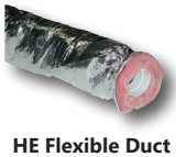
HE Flexible Duct